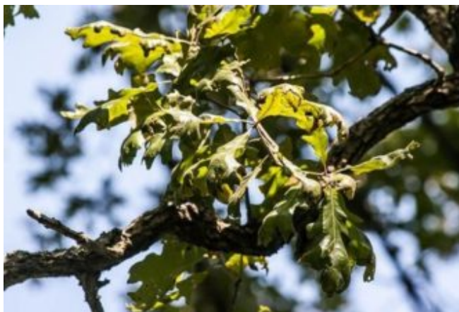
An oak tree exhibits symptoms of damage from dicamba documented by the Illinois Department of Natural Resources.

Executives from Monsanto and BASF, a German chemical company that worked with Monsanto to launch the system, knew their dicamba weed killers would cause large-scale damage to fields across the United States but decided to push them on unsuspecting farmers anyway, in a bid to corner the soybean and cotton markets.